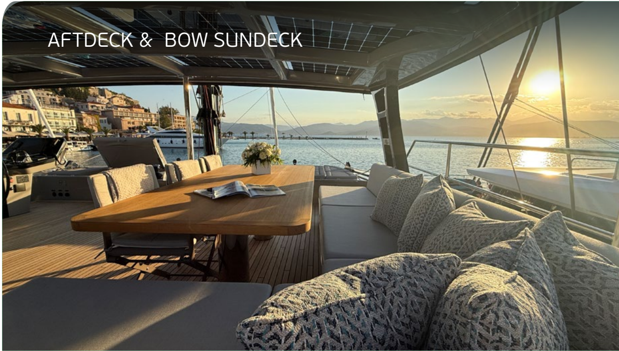
AFTDECK & BOW SUNDECK