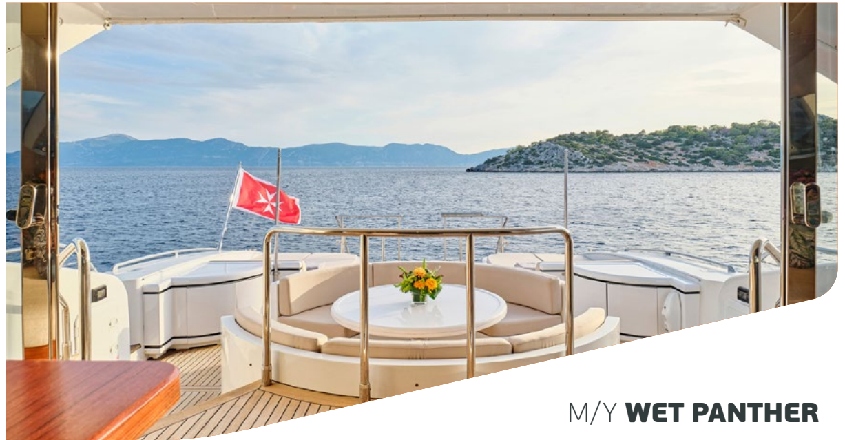
M/Y WET PANTHER