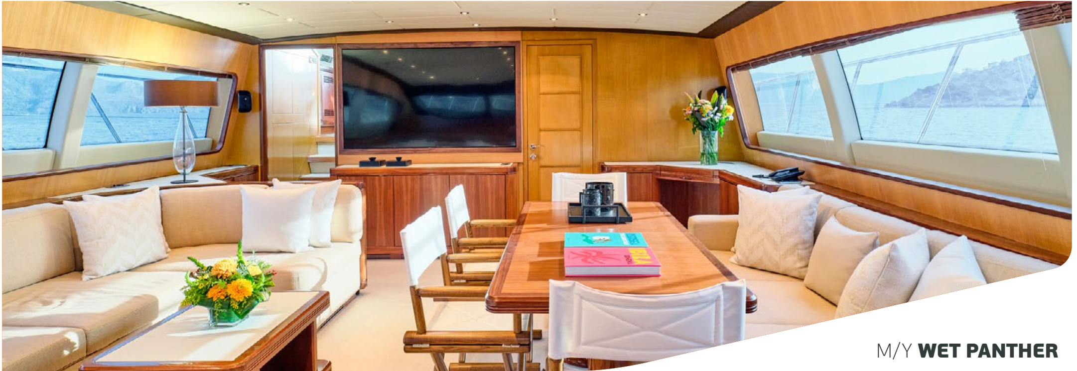
M/Y WET PANTHER