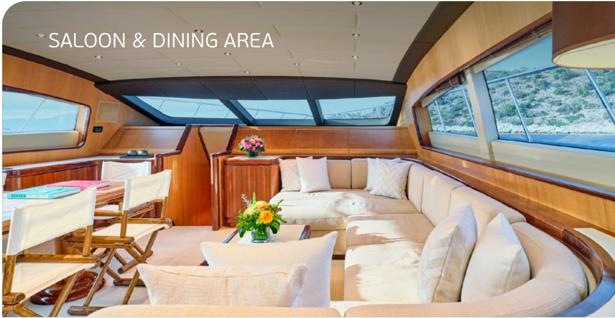
SALOON & DINING AREA