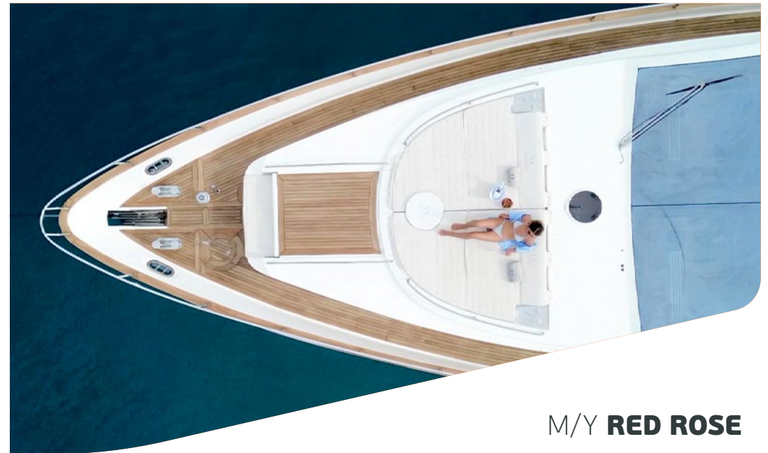
M/Y RED ROSE