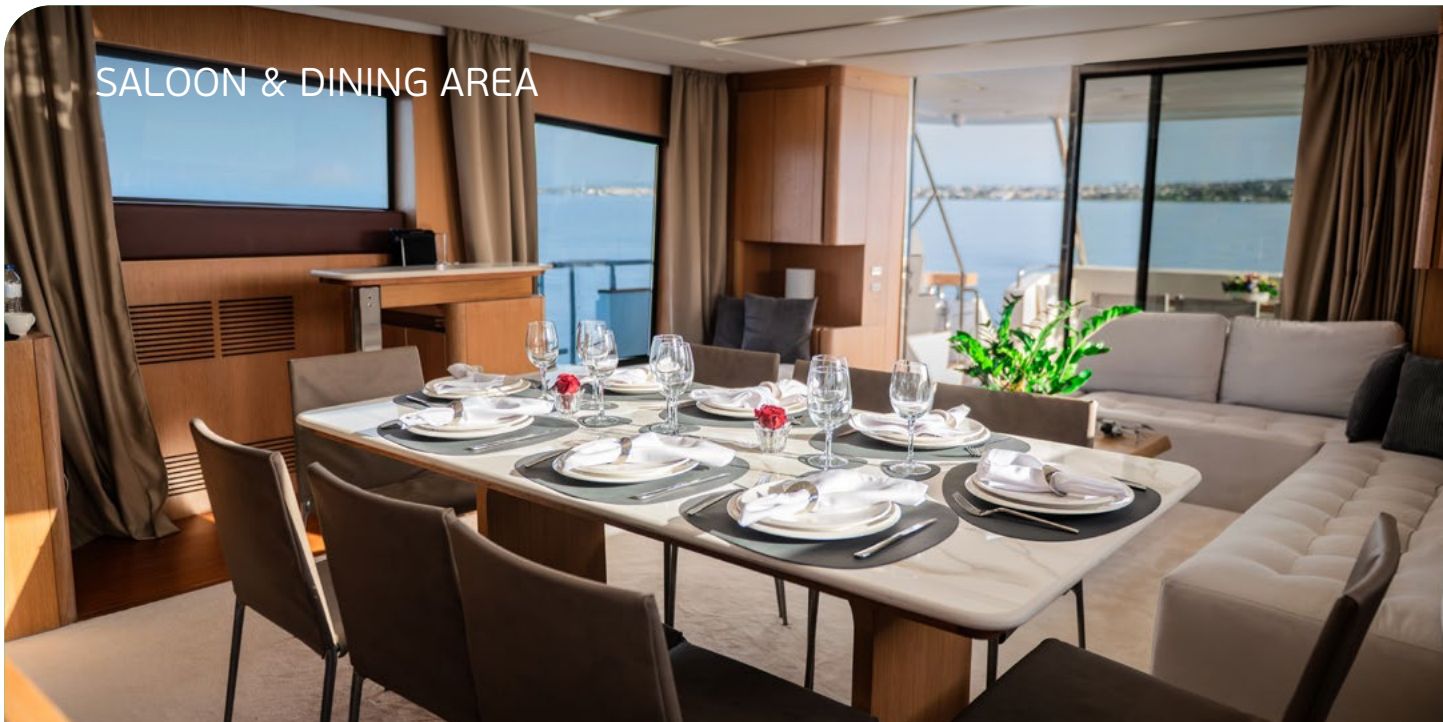
SALOON & DINING AREA