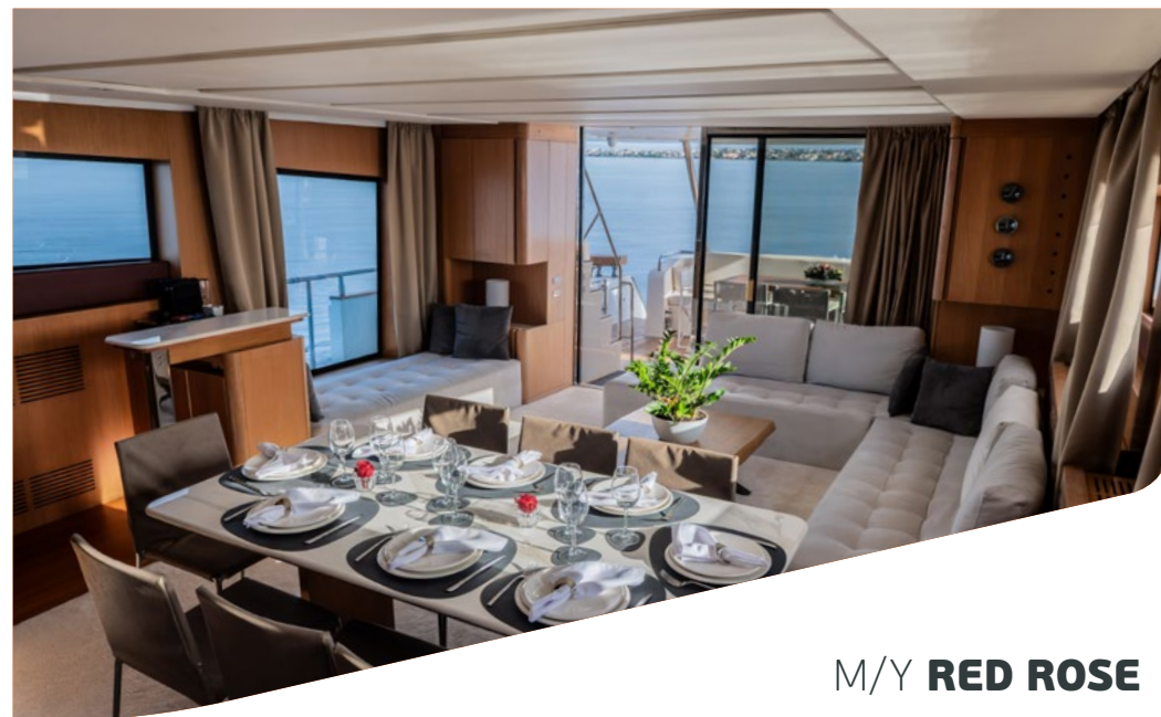
M/Y RED ROSE