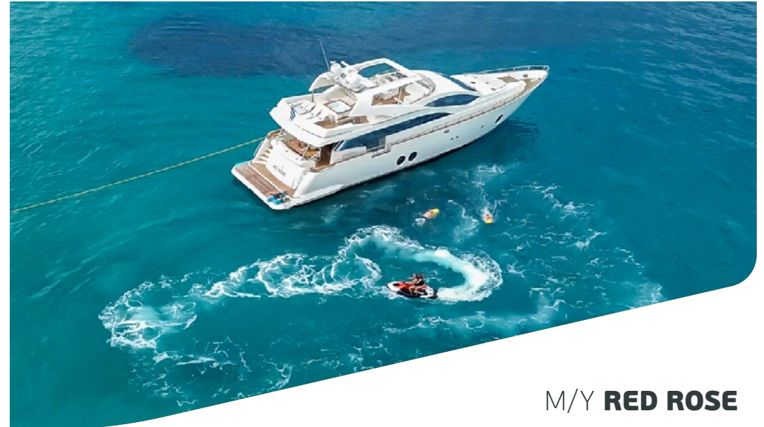
M/Y RED ROSE

STABILIZERS UNDERWAY & ZERO SPEED / JACUZZI ON FLYBRIDGE / IMPRESSIVE SUNDECK WITH BBQ AND OPENING HARDTOP / EXTENDED 2-METER SUBMERSIBLE SWIMMING PLATFORM, DESIGNED TO PROVIDE EFFORTLESS WATER ACCESS / AL FRESCO DINING AREAS ON BOTH THE AFT DECK AND THE FLYBRIDGE, EACH DESIGNED TO COMFORTABLY ACCOMMODATE UP TO 10 GUESTS